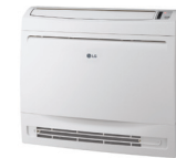
Low Wall Console ● 9,000–12,000 Btu/h ● 9,000–15,000 Btu/h